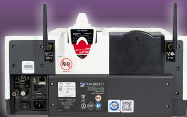
Reverse side of 3885B