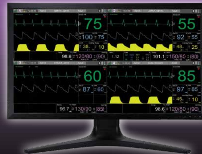
Remote monitoring 4 patients on 1 screen